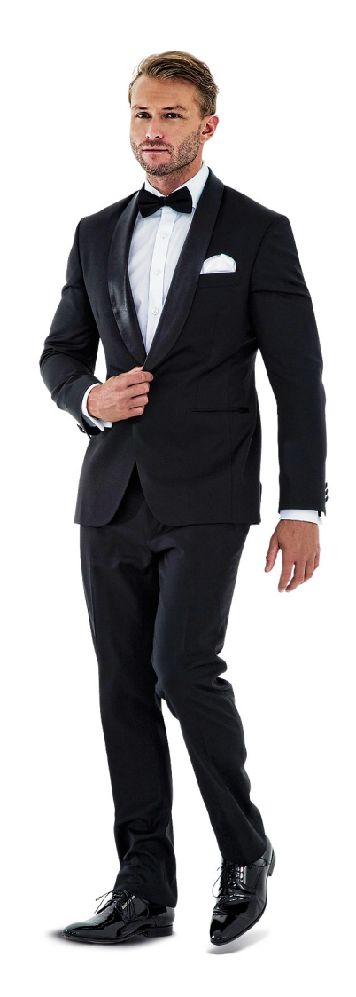
After the wedding, hit the casino with this Bond style one-button black tux with black satin trims, besom pockets & a curved shawl lapel.