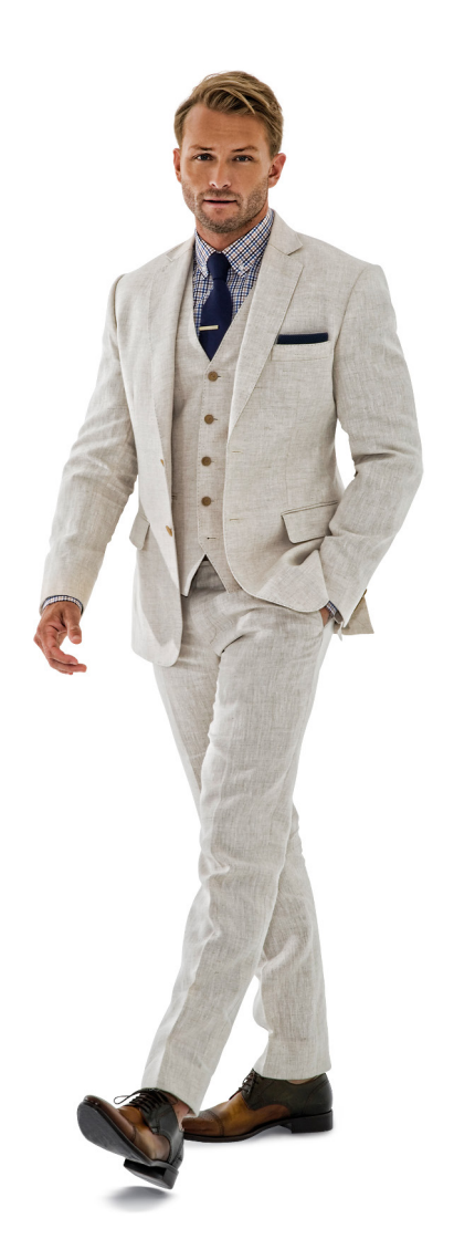
For more laid back weddings, a 3-piece linen sand coloured suit is perfect – especially for outdoor weddings.