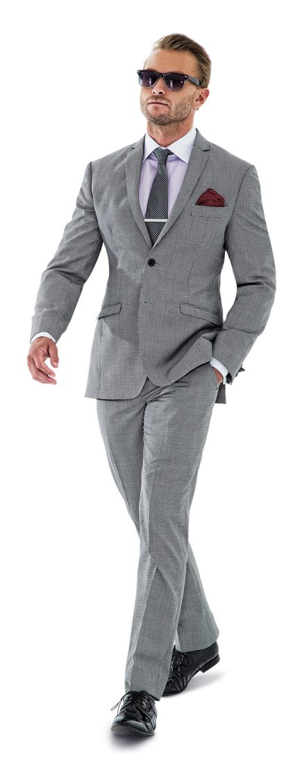
This black & white houndstooth suit is another unique, slightly more laid back look for your wedding – definitely a standout from standard block colours.