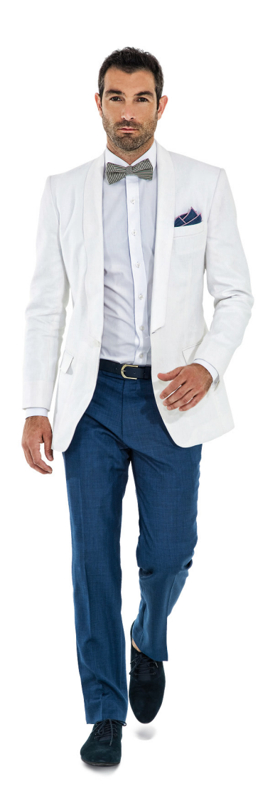
Pair blue sharkskin pants with a white jacket to create another unique look that is sure to stand out & turn heads.