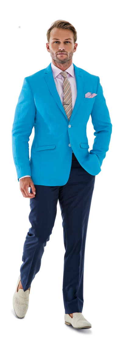
This light blue linen jacket will brighten up the day – pair with darker or lighter pants for another contrast look.