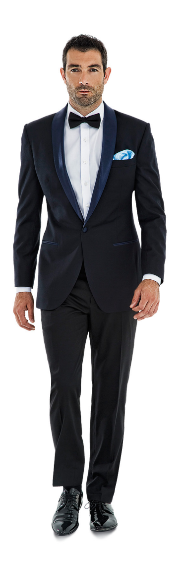
A midnight navy variant of the onebutton shawl lapel tux with navy satin trims, for when you're feeling blue, but in a good way.