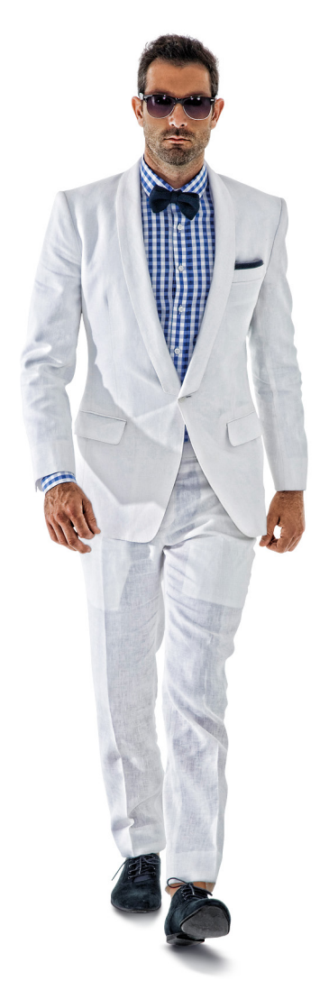
To really make a statement, try this white linen one-button suit with a shawl lapel. Great for a destination wedding in the Greek Islands, for example.