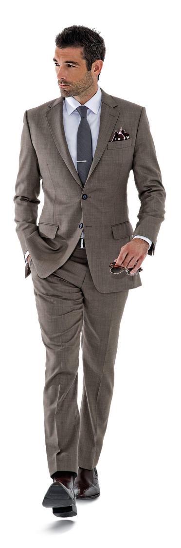
Be different with a khaki birds-eye pattern suit for your wedding. The khaki colour hints at a laid back casual attitude.